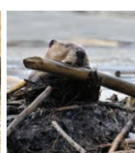
© Center for the Collaborative Classroom