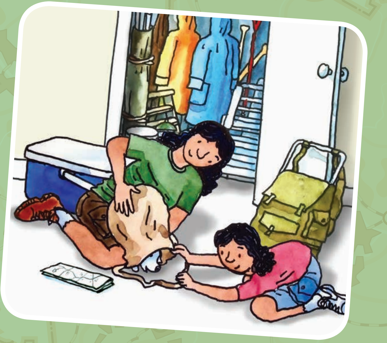
They tip the sack up. What is it?