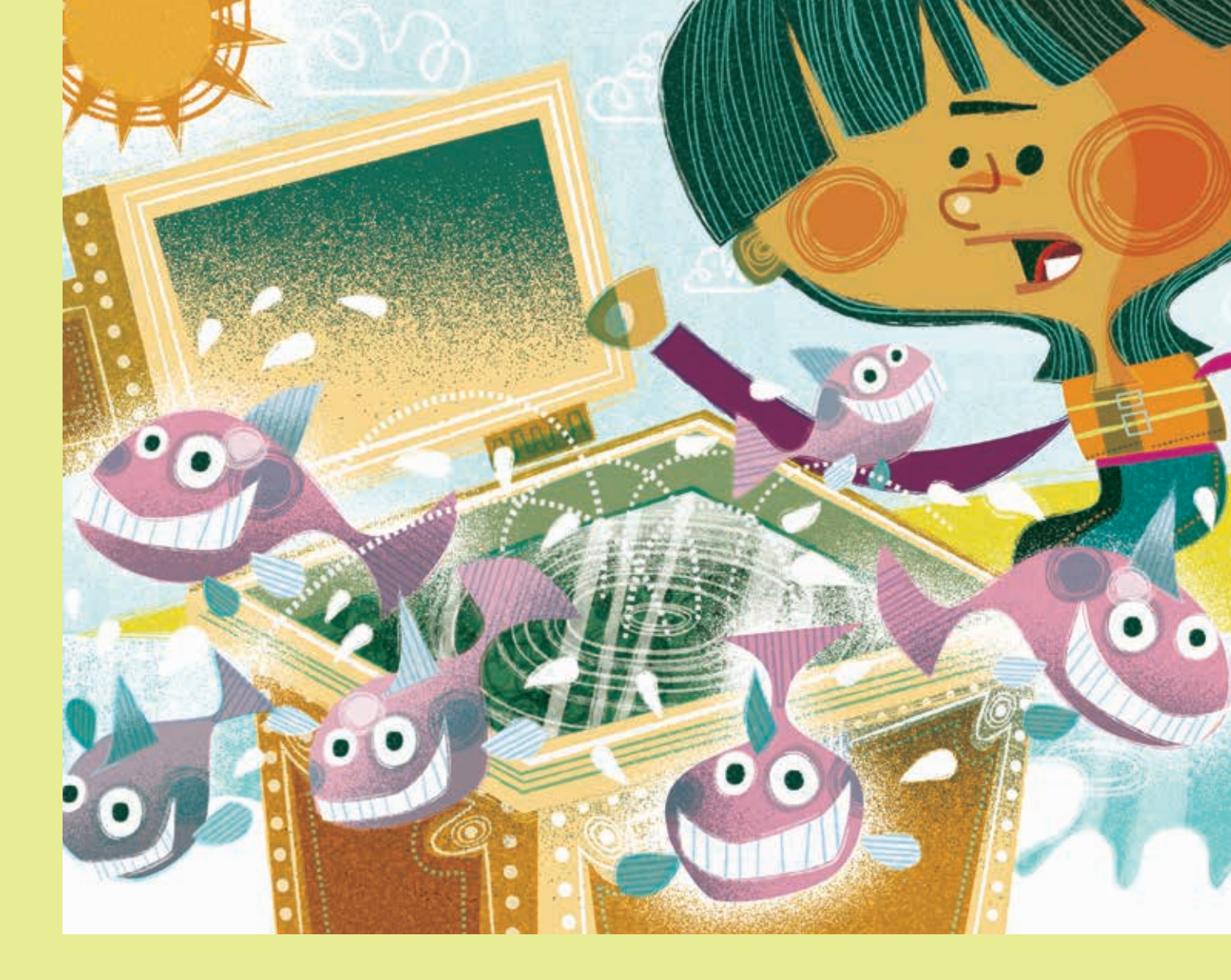
Six fish hop out!

^{\circ} Center for the Collaborative Classroom 13