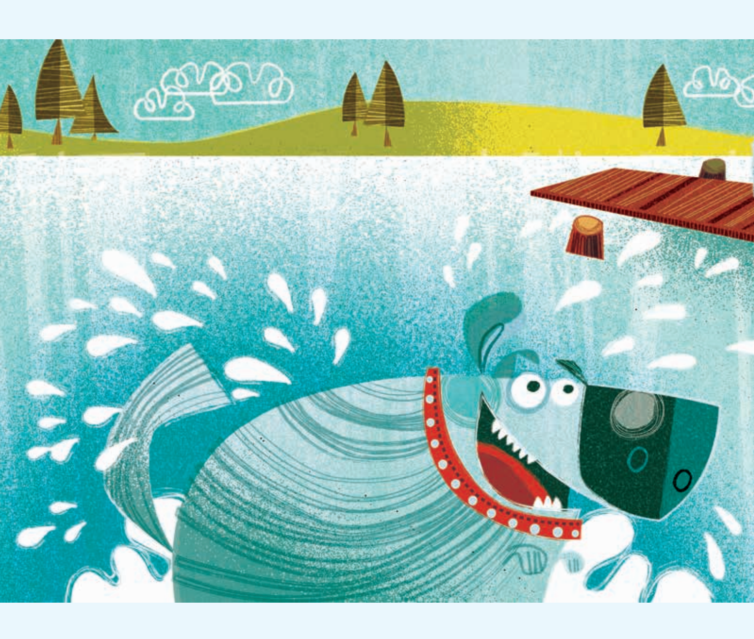
"Come out here, Chuck."