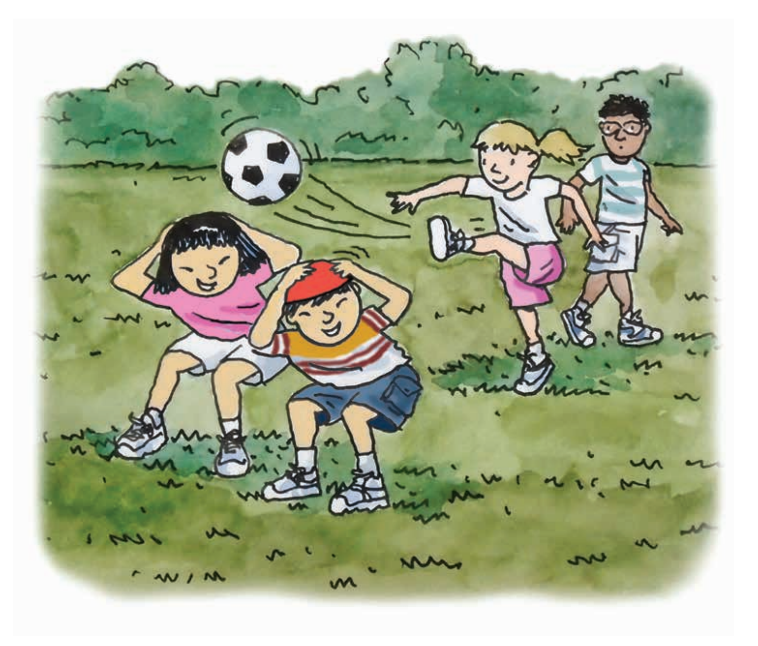
Kit and Cam saw the kids kick. They had to duck.