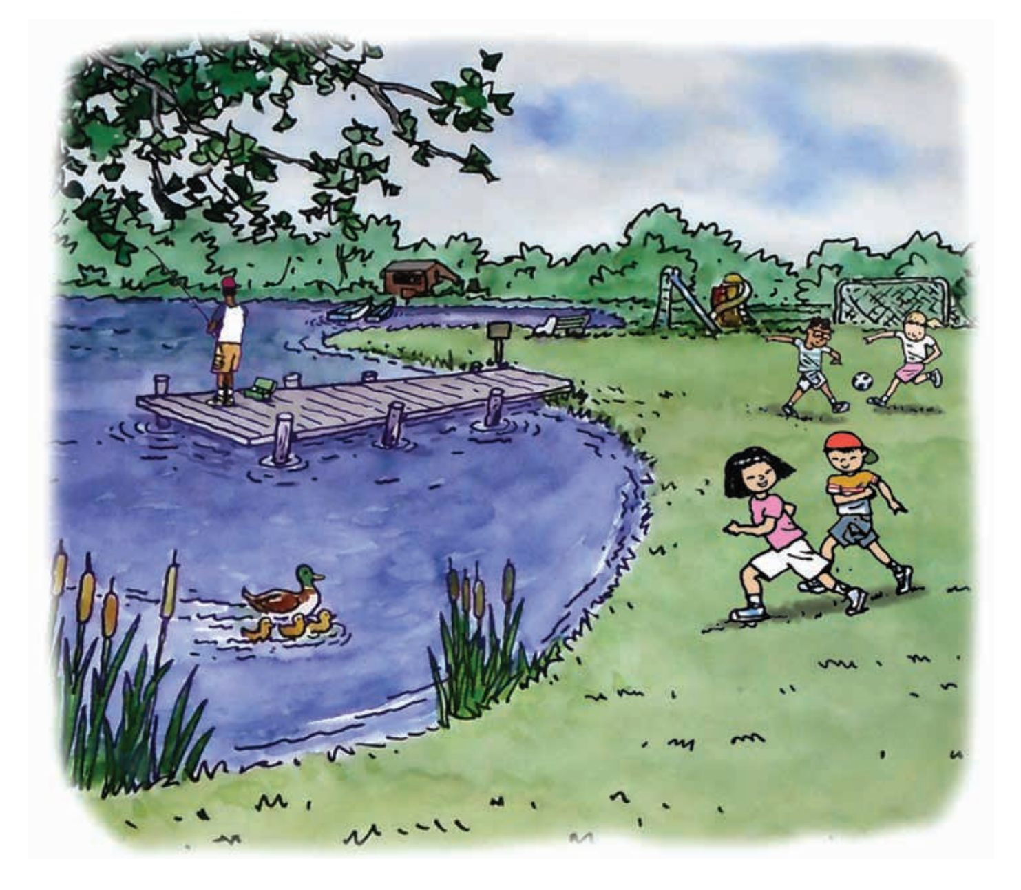
Kit and Cam ran to the dock. They saw kids and ducks.