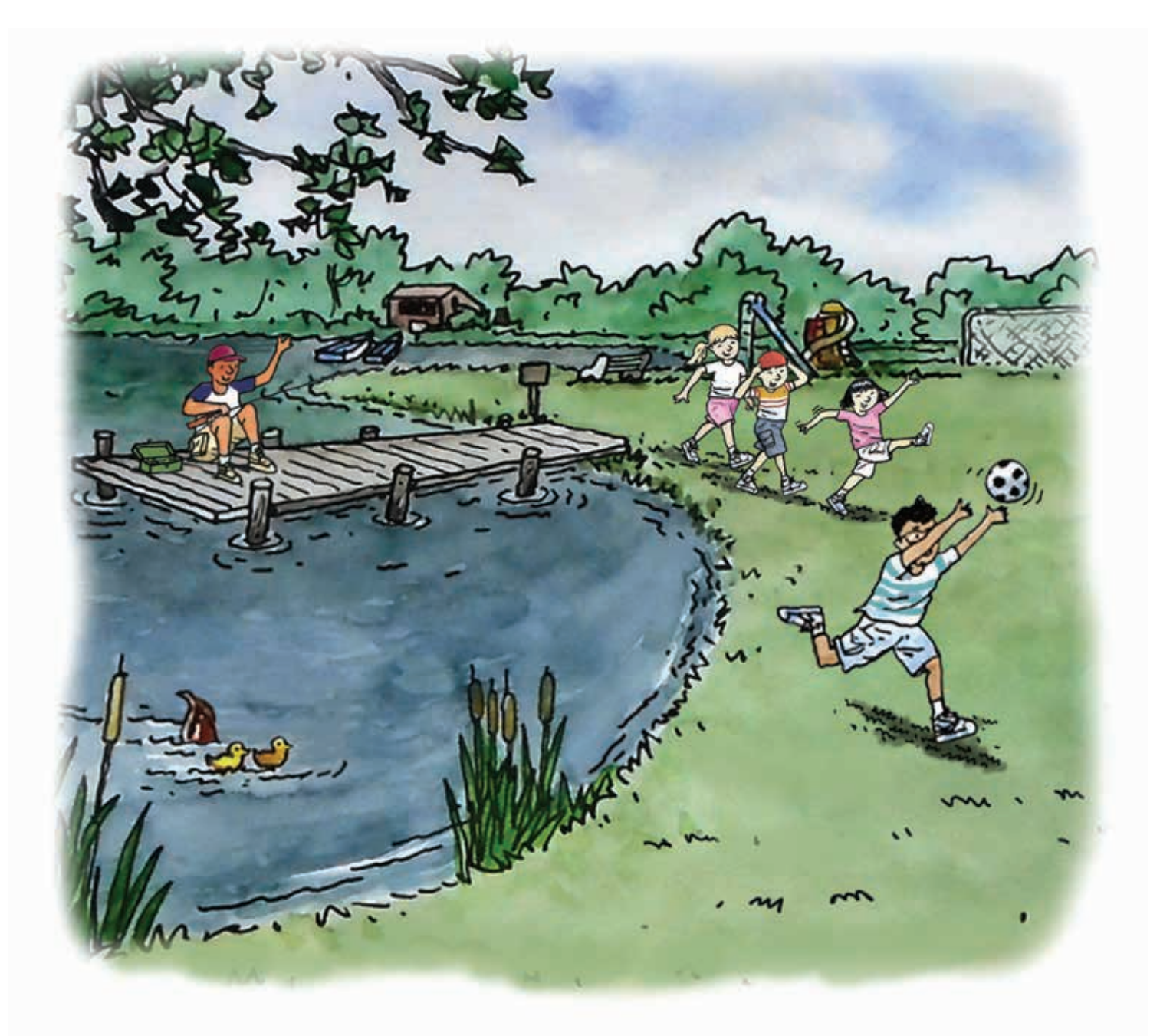
Kit and Cam can kick with the kids.