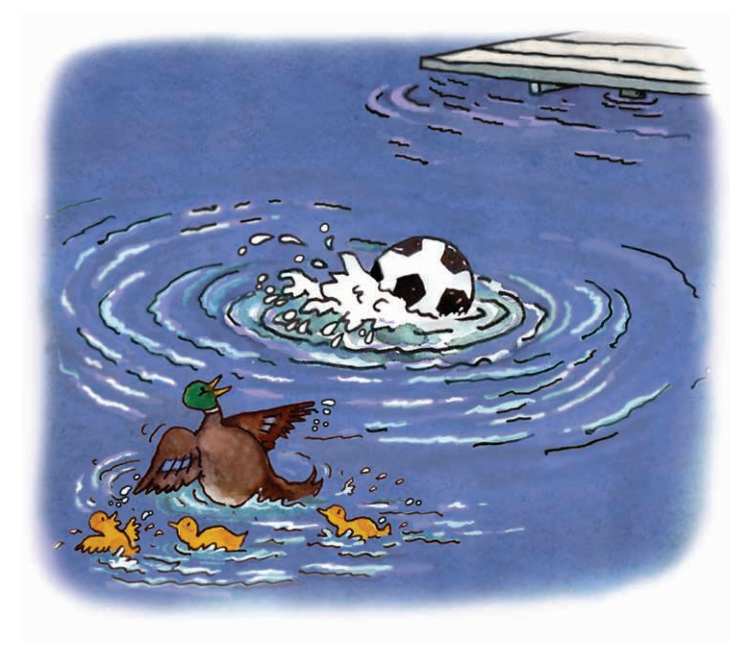
Kit and Cam saw it go by the dock. They saw it go down.