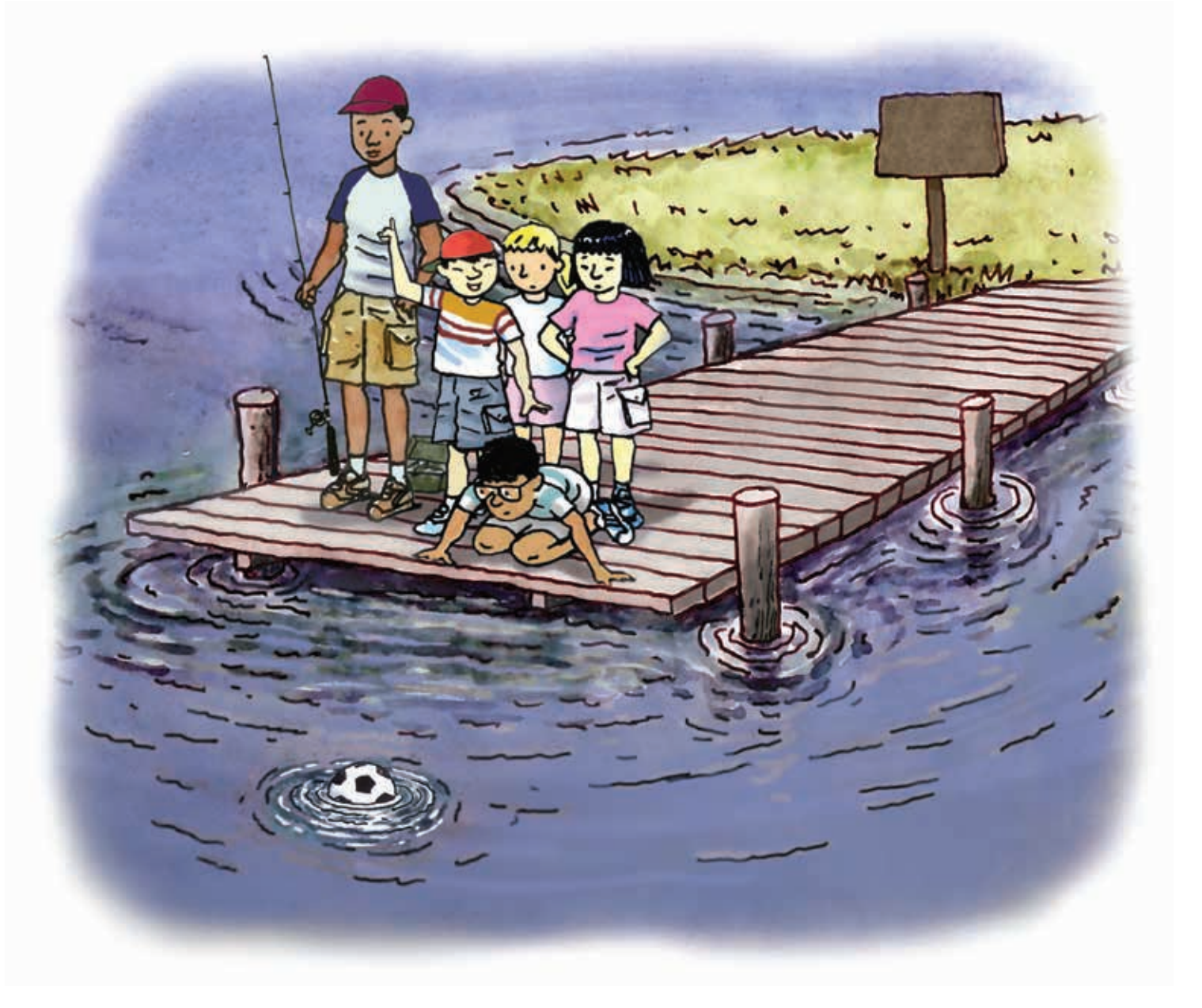
Can they get it?